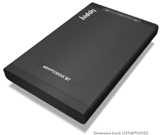
Dimensions (mm): L127xW77xH12.5